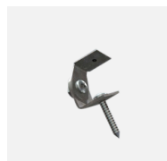
MB-ADJ Adjustable mounting bracket