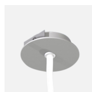
CB-60-R-S | CB-60-R-W Cable base 60, recessed