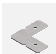
JN-90 90 degree joiner