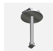
SRK-1-S | SRK-1-W Rod suspension kit (Rod not included)