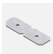
JN-ST Straight joiner