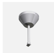
SRK-6-S | SRK-6-W Rod suspension kit (Rod not included)