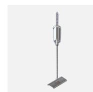
SWK-1-2M | SWK- 1-4M Wire suspension