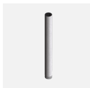
ROD-0.5M | ROD-1M | ROD-2M Suspension rod - 0.5m | 1m | 2m