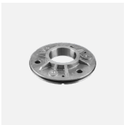
FF-RR20-SS Surface mount flange for JN-TUBE-20-SS, post mount