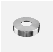
FF-CC-20-SS (satin finish) FF-CC-20-SS-POL (polished finish) Surface mount flange cover cap for FF-RR20-SS