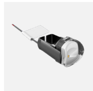
SP-RR20-30-IP20 (IP20 version) SP-RR20-30-IP66 (IP66 version) 0.5W 3000K asymmetric LED spot, IP20 or IP66