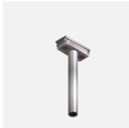
PTBRR-SS (satin finish) or PTBRR-POL (polished finish) Post top bracket