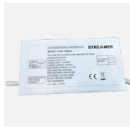
YH24-1502CV Remote emergency pack (for use with XD Profiles Spec Series Emergency LED strips only)