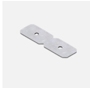
JN-ST Straight joiner