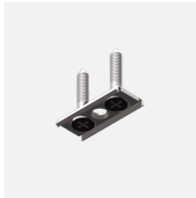
JMC-12 Joinery mounting clip