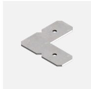
JN-90 90 degree joiner