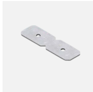
JN-ST Straight joiner