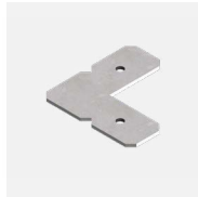
JN-90 90 degree joiner