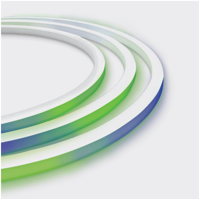
CODE: NEON Y-15W-RGBC