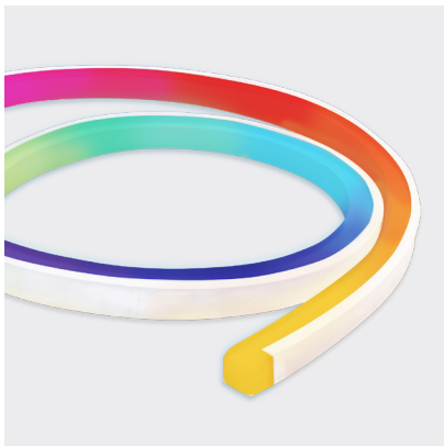
CODE: NEON Y3-15W-RGBC